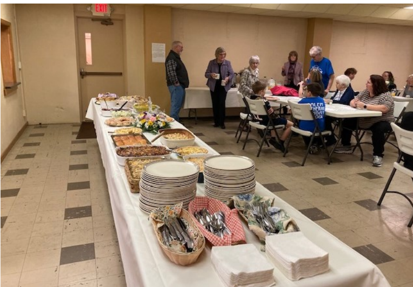
In true Salem tradition, a delicious potluck brunch and fellowship followed the worship service.