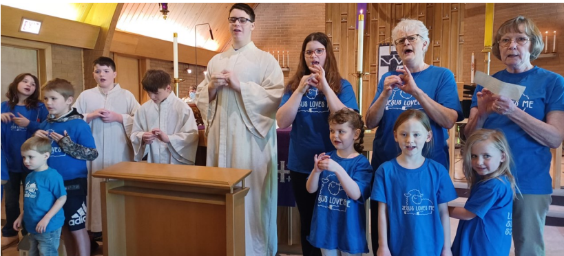
Sunday School students sang "We Are the Church".