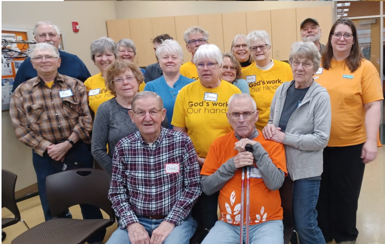
Left: This group of 17 volunteers packed 4,228 pounds of canned corn at the Northern Illinois Food Bank on March 19.