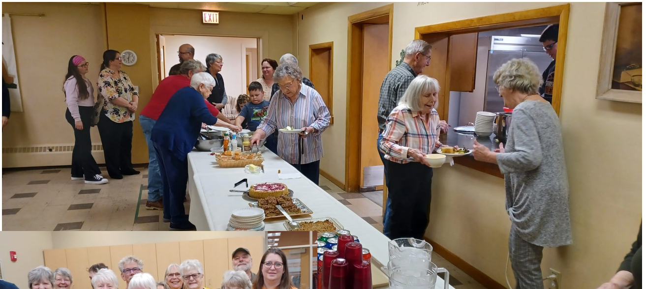
Above: Diners enjoyed five soup suppers on Wednesday evenings during Lent. Suppers were hosted by various committees.