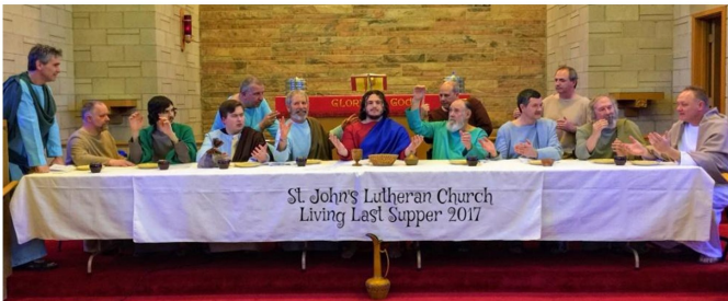
The men and women of St. John's Lutheran Church in Peru are pleased to present the chancel drama: