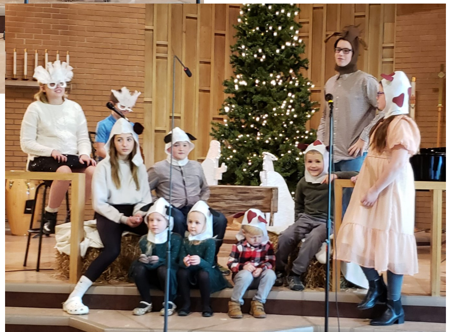
At right, the "Friendly Beasts" gather around the manger to tell their version of Jesus' birth.