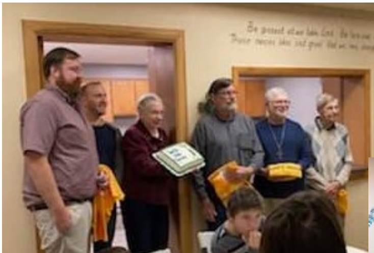
LEFT: On January 7, those people who were instrumental in accomplishing the renovation of our church kitchen were honored at a special coffee fellowship. They each received a GOD'S WORK. OUR HANDS. T-shirt to thank them for their efforts.