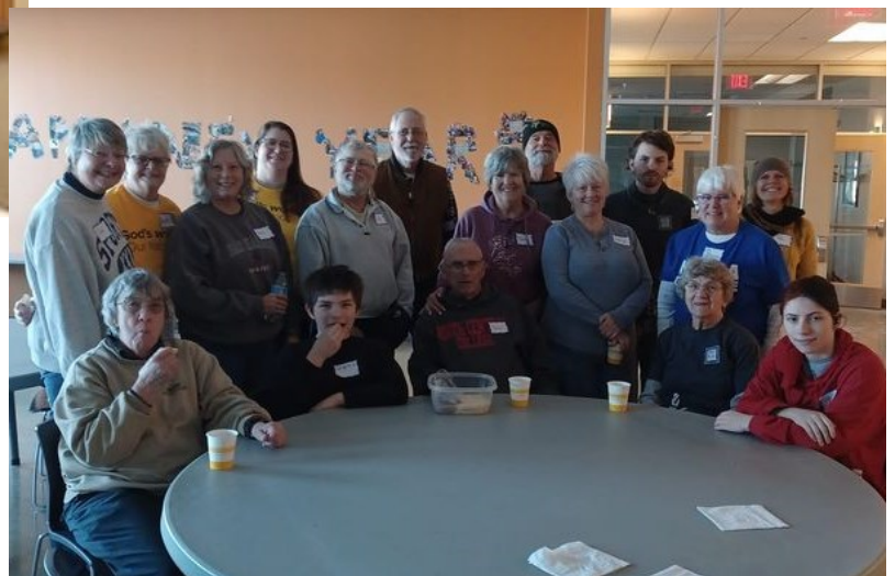
RIGHT: Seventeen people made up the volunteer team that processed 7,625 pounds of food at the Northern Illinois Food Bank on January 16.