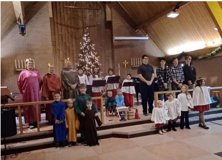
Sunday School Christmas Program