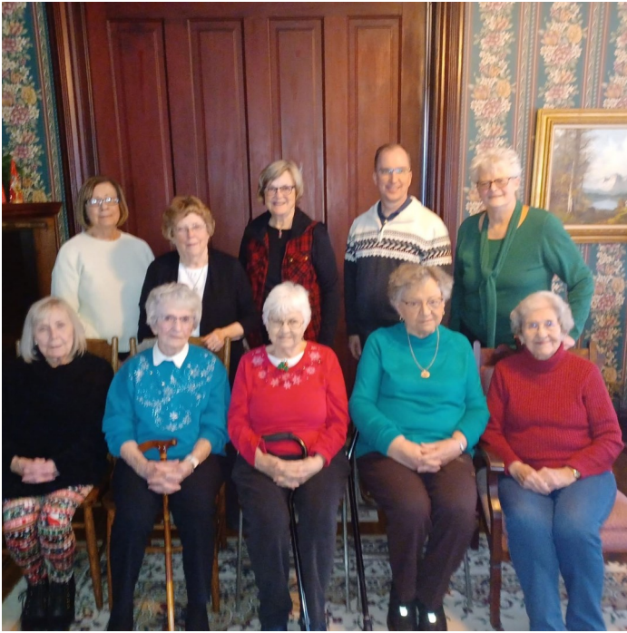
Ruth Unit Christmas Gathering