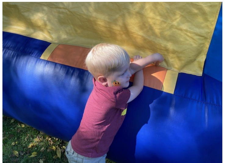
EVEN OUR LITTLEST KIDDOS ENJOYED THE BOUNCE HOUSE.