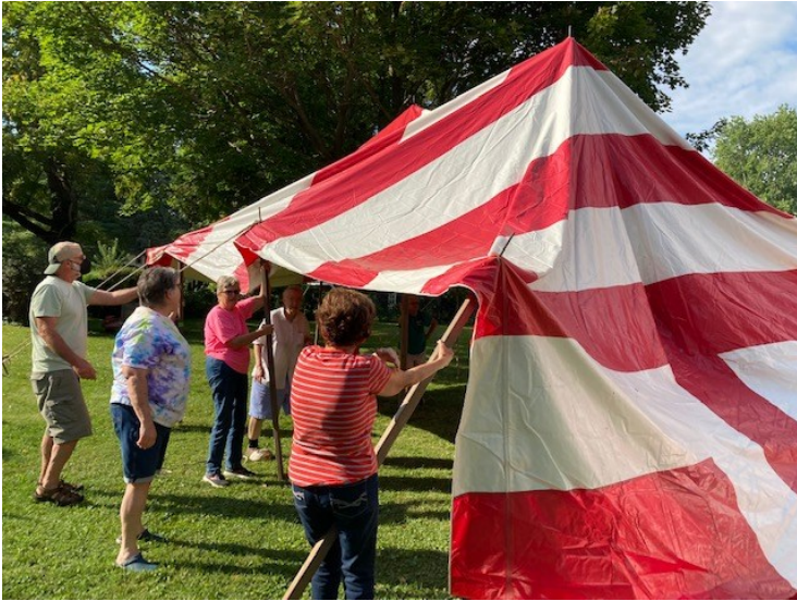
RAISING THE TENT—MANY HANDS, BUT THE WORK WAS NOT LIGHT