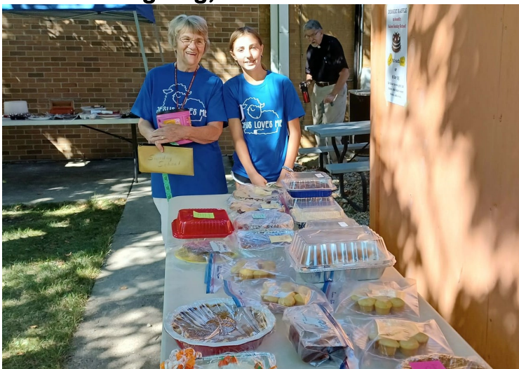
DESSERT RAFFLE EARNED $176 FOR SALEM SUNDAY SCHOOL.