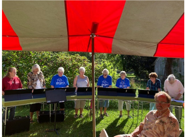
SALEM HANDCHIMES ARE BACK AFTER THEIR LONG BREAK.